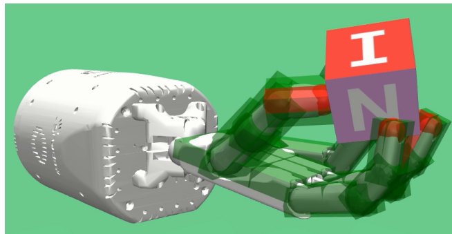
Fig. 1: MuJoCo simulation of a Shadow-Hand for dexterous in-hand manipulation with 92 touch sensors from [1]. Touch sensor sites, activated by the contact with the cube, are highlighted in red while the inactive sites remain green.

to infer actions, we need to reconstruct the lacking vision based observation in SE(3) . The policy network g by [1] demands an observation o = (o_P, o_T, o_O) consisting out of the proprioceptive o_P \in \mathbb{R}^{48} , touch o_T \in \mathbb{R}^{92} , and object state o_O \in \mathbb{R}^{13} values to infer action a , i.e. the next joint positions to be executed by the simulator environment. An object’s state, i.e. the vision based observation, o_O comprises the pose (position o_{O_P} and quaternions o_{O_Q} ) and velocities (linear o_{O_L} and angular o_{O_A} ).